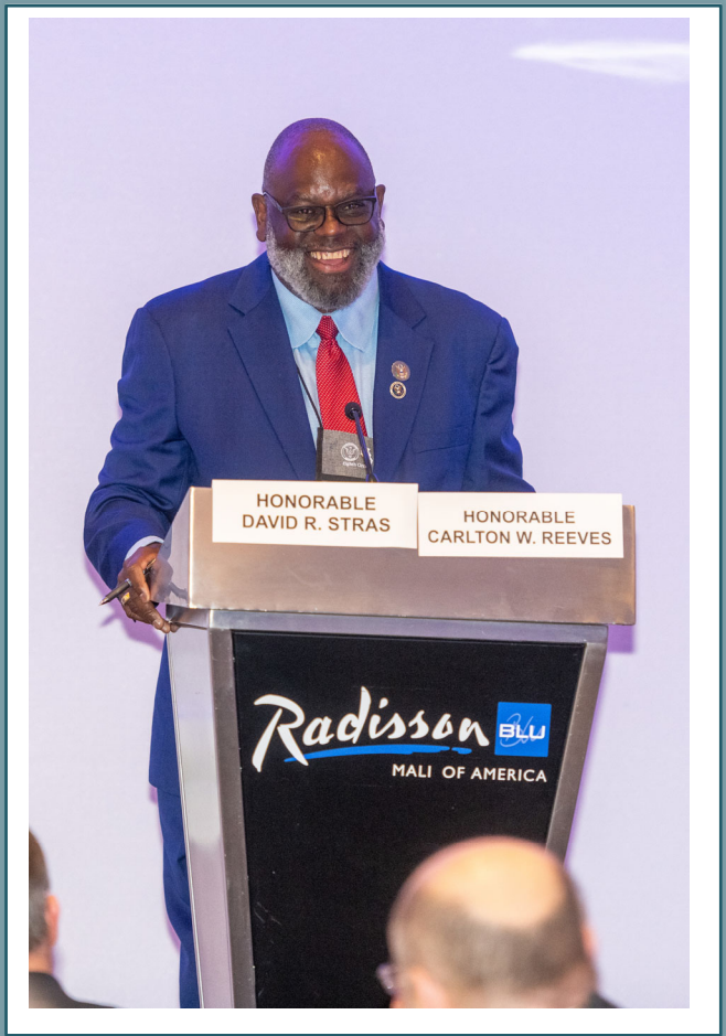
The Hon. Carlton Reeves, U.S. District Judge for the Southern District of Mississippi, and chair of the United States Sentencing Commission, spoke at the conference luncheon on July 13.