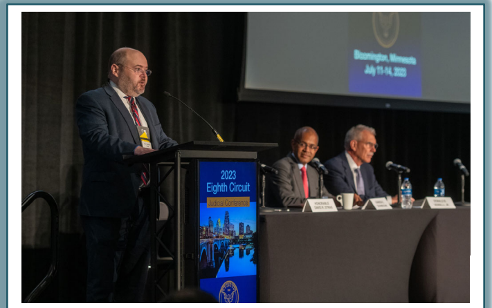
The Hon. David Stras moderated a discussion about the U.S. Supreme Court with Kannon Shanmugam and Donald Verilli.